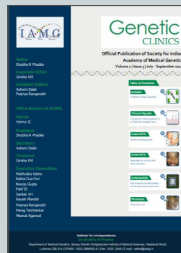
25 th issue: 2014